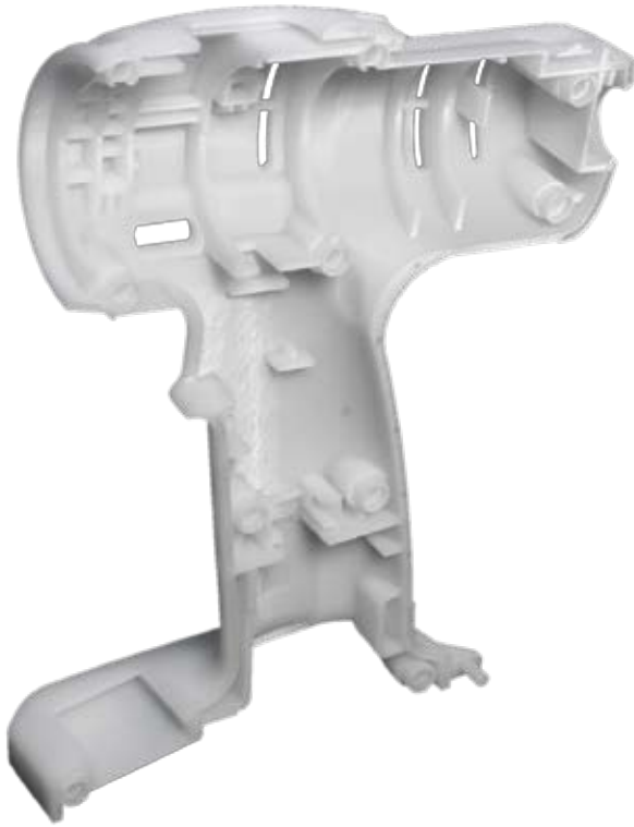
Cordless drill prototype for future assembly testing.

Simulate the look and feel of molded ABS with this tough and versatile plastic.