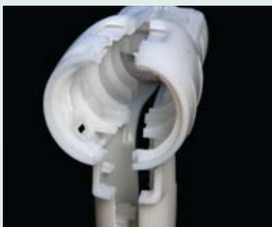
Durable and rigid testing.