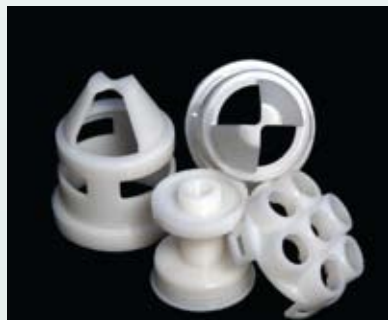
Look and feel of molded ABS.