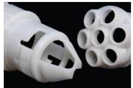
Spa water jet prototypes.